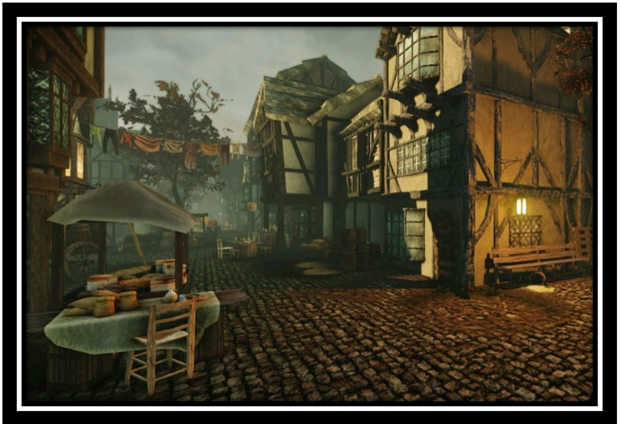
An example of 17th-century taverns and market stalls, and the cobbled streets of London