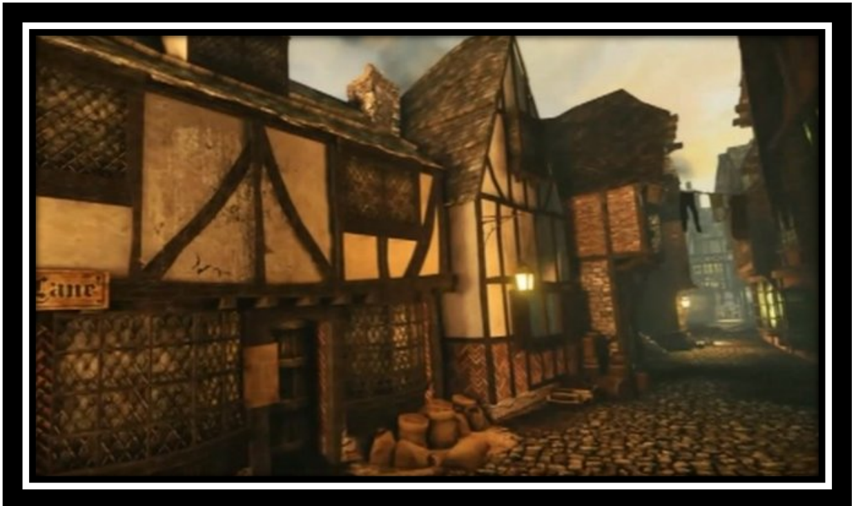
Another example of Pudding Lane 1666