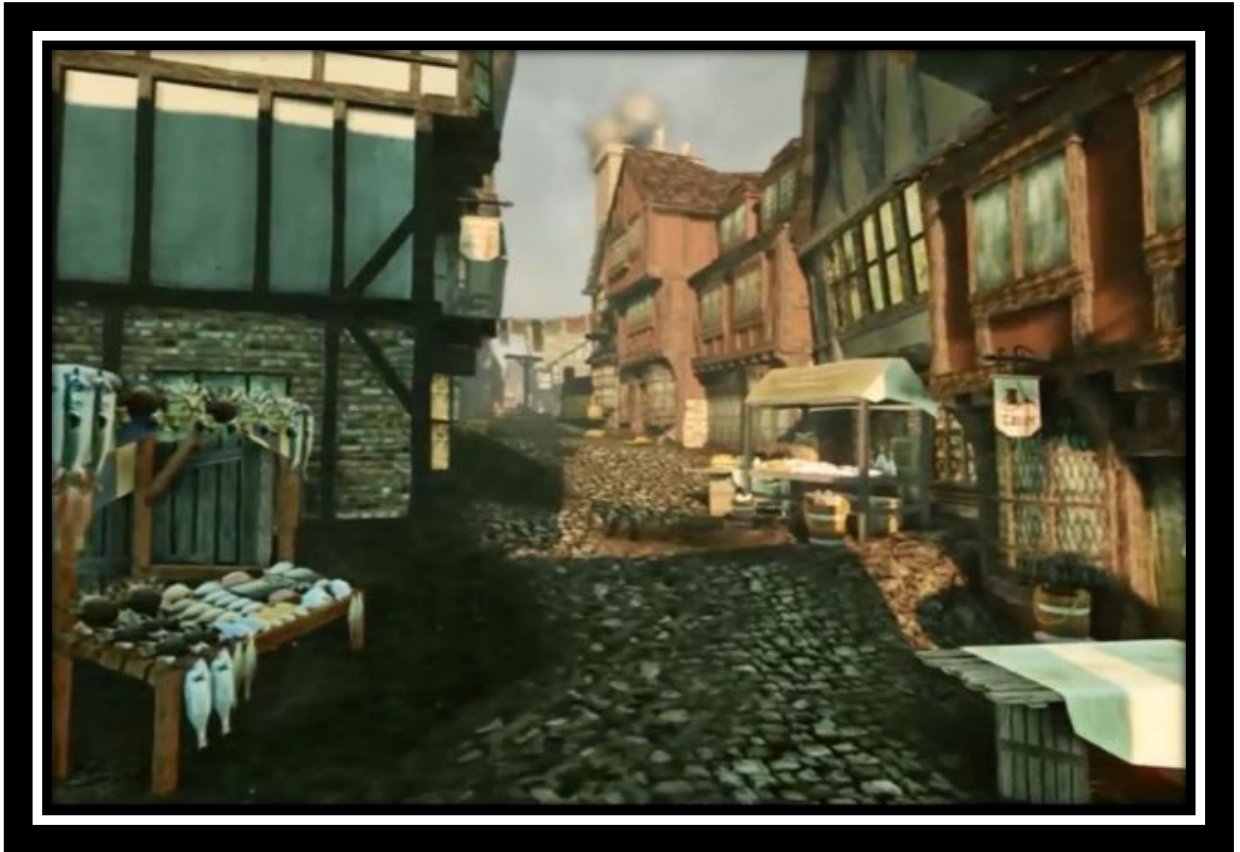
An example of what Pudding lane may have looked like in 1666